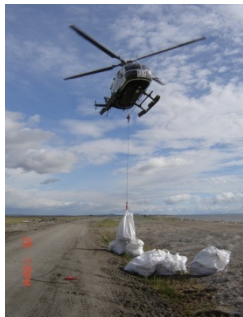
Helicopter being used to transport Geobags of contaminated waste.