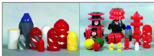
Steel Mandrel Pigs, Polyurethane Spheres, Polly-Pigs, Solid Cast Polyurethane Pigs, Replacement Cups & Discs