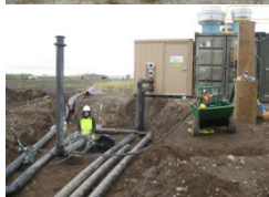
Installing a High Volume Vapor Extraction System