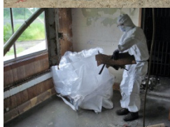
Asbestos/Lead Based Paint Removal