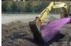
In-Situ Chemical Oxidation of Chlorinated Hydrocarbons (RCRA)