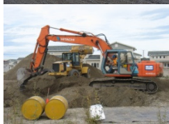
Excavating Munitions and Explosives of Concern (MECs)