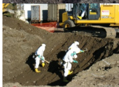
Agent Orange Site Hand Excavation. Level B PPE