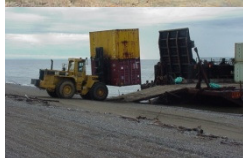
Loading Connexes onto a Barge